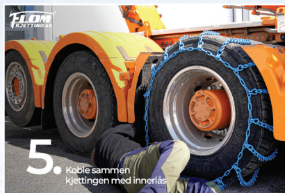
5. Hook up the inner side chains.