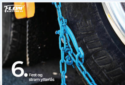
6. Hook up the outer side chains and tighten.

You will find more information about driving on Norwegian winter roads on Trucker's Guide: www.vegvesen.no