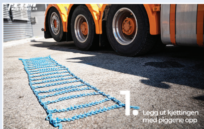
1. Lay the chain on the ground with the studs facing upwards.