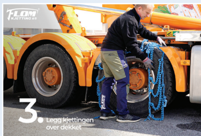
3. Lift the chain onto the wheel.